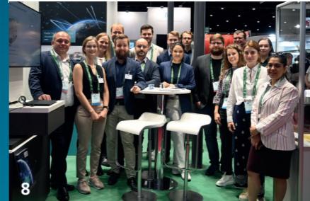
Berlin, September 17-22 European Microwave Week A large team from Fraunhofer FHR was represented with 2 exhibition booths, 6 workshops, 8 presentations, and a poster session. They showcased radar applications for industry, numerous examples of additively manufactured high-frequency components, as well as the work of the research network terahertz.NRW .